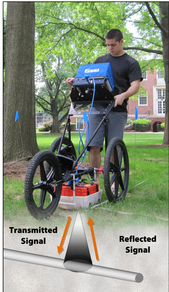
Figure 2: Basic GPR system.