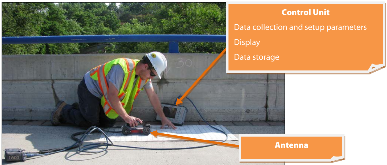
Figure 1: Complete GPR system.

A GPR system is made up of three main components: the control unit, antenna, and power supply (Figure 1).